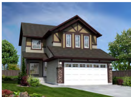
TUDOR ELEVATION w/ Optional Stone

Main Floor 954 sq. ft. Upper Floor 1129 sq. ft. Total 2083 sq. ft.